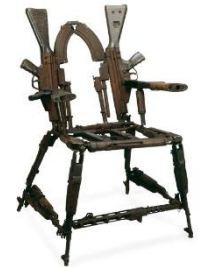
The Throne of Weapons

How Great Thou Art and And Can it Be are in their traditional settings. We have an unfamiliar setting for Lord of All Hopefulness .